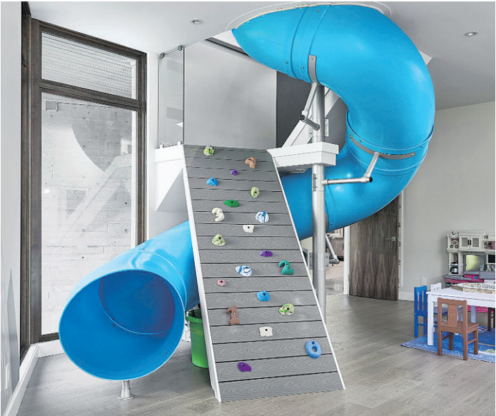
The home features a slide, right, that connects the upper and main levels, polished concrete floors, a cantilevered roof and board-formed concrete on the exterior. JOSHUA LAWRENCE